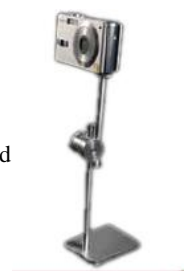
MS1-150 stand With camera

M503 USB Microscope 2Mp with tripod and 6 blocks $