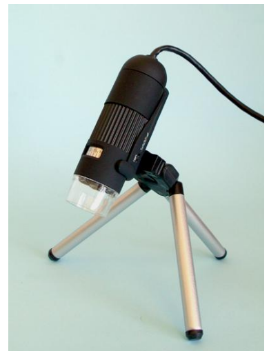
M503 with tripod