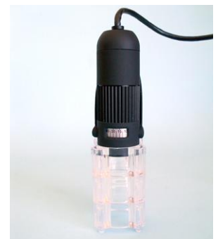
M503 on blocks